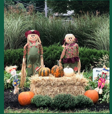
Fall Flourishes on Rte. 520 Island