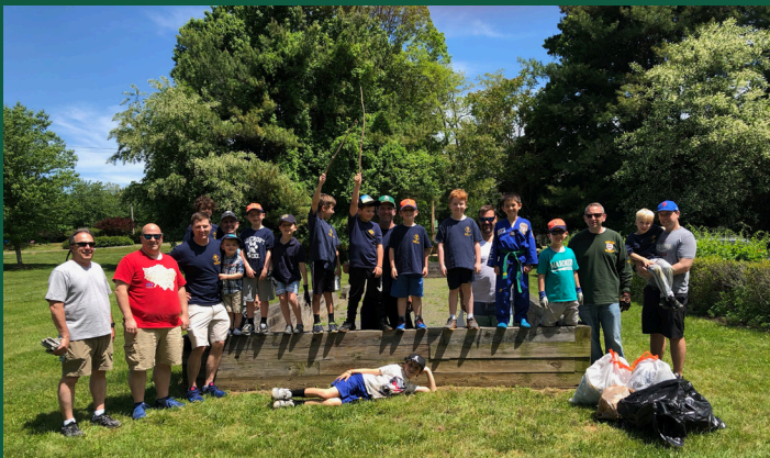
Cub Scout Pack 210